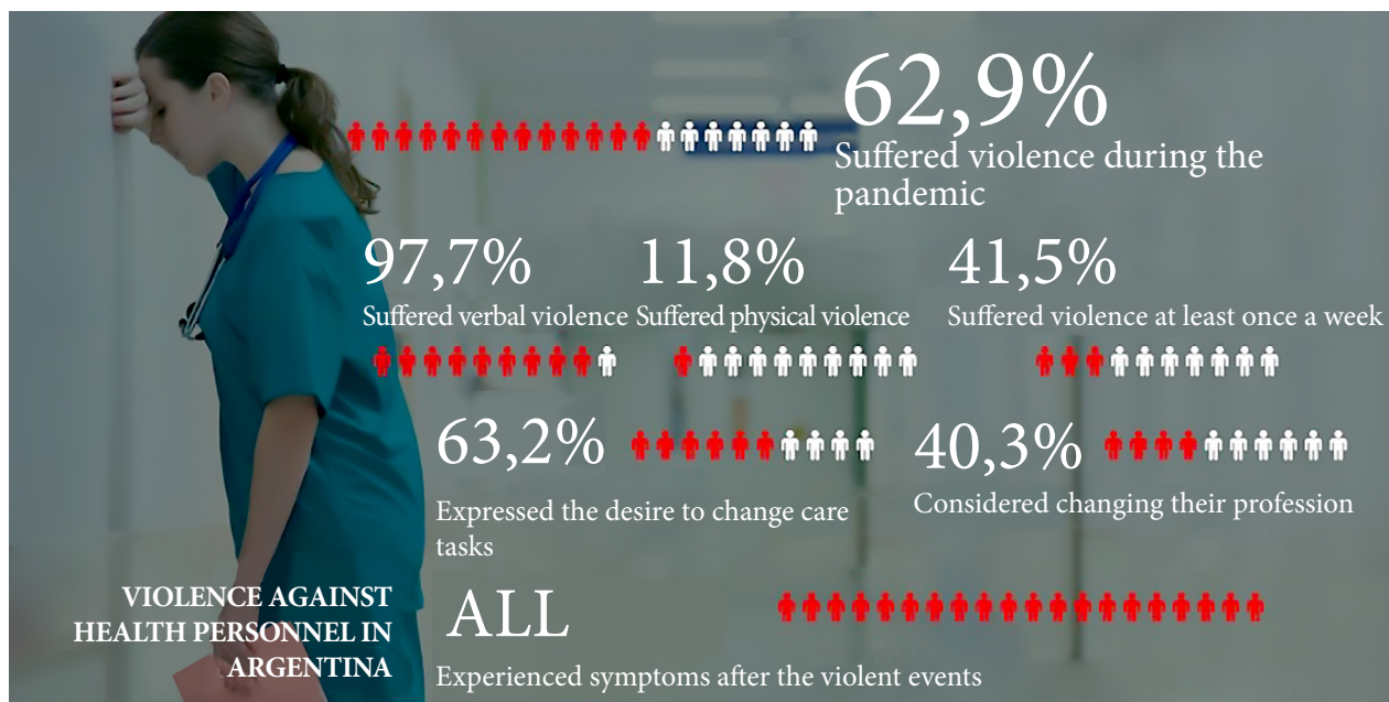
Figure 2. Graphical summary: frequency and impact of acts of violence among healthcare workers in Argentina.

A Poisson regression was performed to establish whether health personnel in Argentina had experienced more violence than their peers in other Latin American countries. In the crude model, participants from Argentina had a violence prevalence ratio of 1.15 (95% confidence interval [CI]: