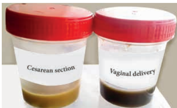
Figure 1. Meconium in neonates had a greenish-yellow coloration due to formula feeding in those born by cesarean section (left) and had a greenish color in breastfed neonates born vaginally (right).

In the pre-enrichment stage, two meconium samples from newborns by cesarean section formed gases that released unpleasant odors, said samples were then planted in MacConkey agar. After incubation, the presence of colonies of enterobacteria was confirmed.